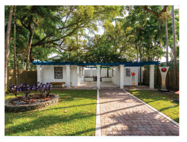
$28/SF (NNN) + $13/SF CAM lease rate